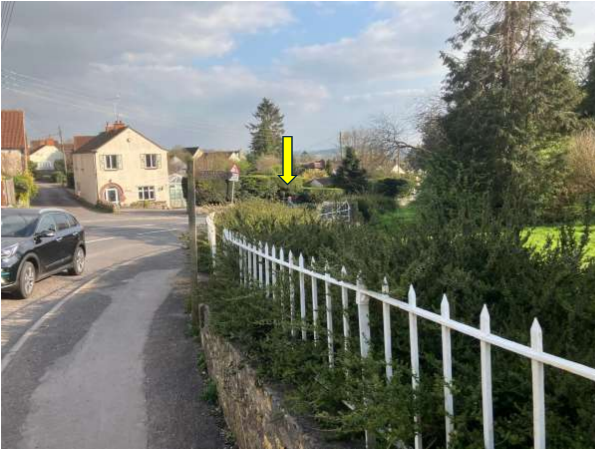
View from crossing point to sight line position for 20 mph