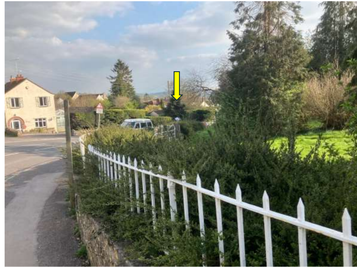
View from crossing point to sight line position for 24 mph