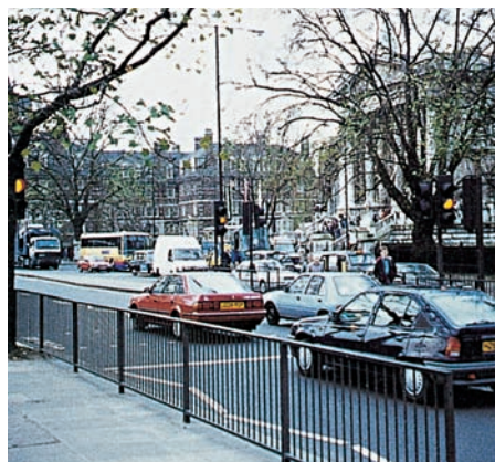
Left handed stagger installation.

5.2.5 Staggered crossings on two-way roads should have a left handed stagger so that pedestrians on the central refuge are guided to face the approaching traffic stream. At some crossings a right handed stagger may be unavoidable. Where this is the case, and there are far-side pedestrian signals, confusion can be caused if the pedestrian signals can be seen simultaneously. A waiting pedestrian may “see through” a red signal to a green signal at the opposite crossing. Careful alignment and special precautions to limit the field of view may be needed.