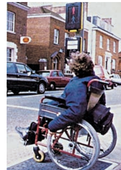
The push button should be readily accessible.

5.1.9 The push button unit should be close enough to the tactile surface to allow all pedestrians, who could reasonably be expected to use the crossing, to reach it easily. This is particularly important for crossings with kerb-side detectors.