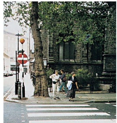
Street furniture and a well established tree obstructing the approach to a Zebra crossing.

4.5 As with refuges and signal-controlled crossings, it is important to keep the approaches to the Zebra crossing clear. Trees and street furniture are a hazard for pedestrians, especially those with disabilities.