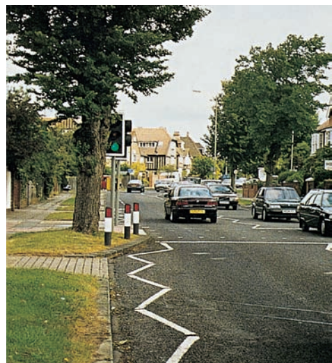
Built out kerb to improve the sight lines.

2.3.2 Pedestrians must be able to see and be seen by approaching traffic. Visibility should not be obscured or restricted by, for example, parked vehicles, trees or street furniture. If it is not possible to site the crossing elsewhere consideration must be given to either removing/resiting the obstacle or, if the carriageway is sufficiently wide, to building out the kerb-line to provide enhanced sight lines. Particular care should be taken when drawing up the layout for a new crossing. For example, the controller should not be in a position that obstructs the intervisibility between pedestrians and approaching vehicles. The designer is responsible for anticipating not only the problems for maintenance but also the particular visibility problems for wheelchair users and children. If visibility is restricted by parked/loading vehicles, it may be necessary to make a Traffic Regulation Order or impose the maximum waiting and loading restrictions in the appropriate Crossing Regulations.