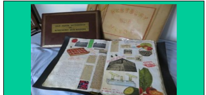
The Heritage Books

Following this, there will be the opportunity to join us for a talk by Team Wilder about how we can all do our bit to conserve the local environment.