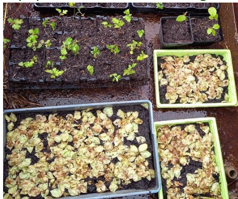
Wych elm seeds and hawthorn seedlings

We aim to produce at least 2,000 trees per year – enough to plant 500 metres of hedge or up to an acre of woodland. With the current emphasis on tree planting we don't expect to have any problems finding them a home. This year we will have grown around 1,000 seedlings which should be ready for planting out in the winter of 2022/23.